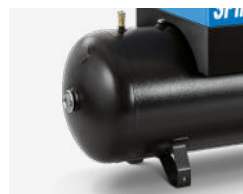
// 500-litre tank

Get more air storage and say goodbye to condensation worries.