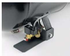
// No-loss timer drain