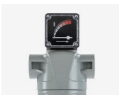
// Line filter

With its wide range of options and flexible build, the Spinn 2.2-7.5 can meet all of your needs.