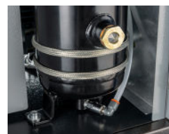
// Oil heater

Get more air storage and say goodbye to condensation worries.