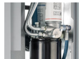
// Tropical thermostat

Ensures no intermittent-use condensation by keeping the oil temperature constant during unloading or idle periods.