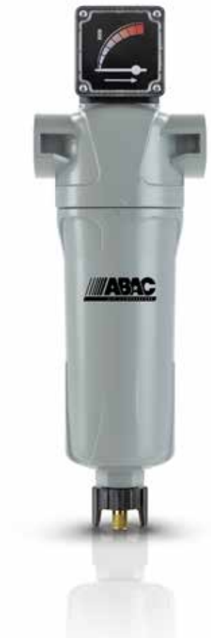
Pressure Conversion Kit