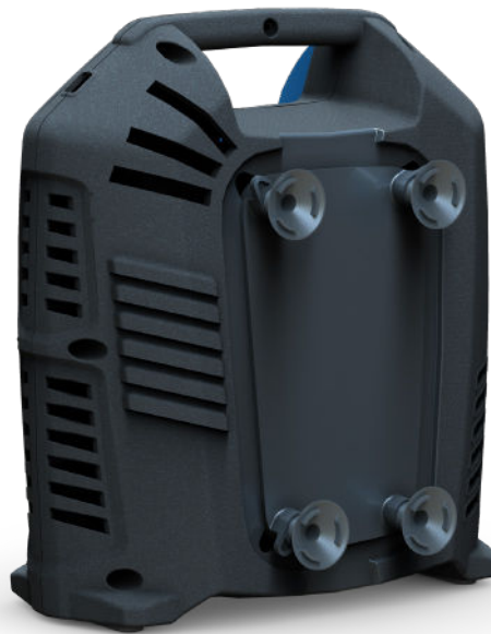
SUITCASE 0 1.5 HP

Extra small sizes are not reflecting the performances of ABAC Suitcase which offers on the contrary important air displacement of 160 l/m, 8 bar pressure and relies on 1,5 HP engine power.