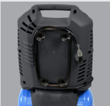
Extra shock absorber feet for horizontal use.

Ease of use and compactness are the most notable attributes behind new ABAC Suitcase air compressor.