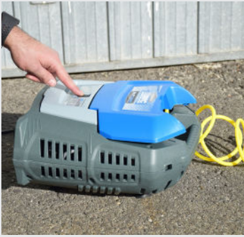
Designed to work efficiently both in vertical and horizontal position.