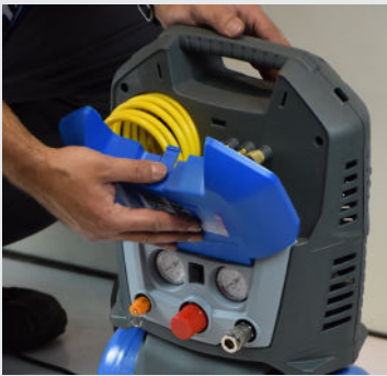
Smart flap for your tools storage. Be always ready.