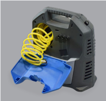
Spiral hose with universal tools mount.